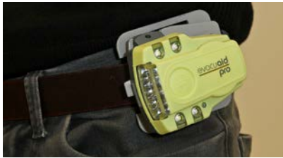
Optional multipurpose clip

With our optional hazard kit Evacuaid can be fastened in the belt or on personal equipment and still be active, ready to alert others if something happens. By turning the flashlight off Evacuaid can function as a man down device for people working in hazardous areas or confined spaces for up to 300 hours.