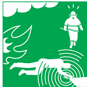
Automatic alarm - be found when time is critical