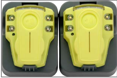
Wall mount bracket is included

✓ Always at the ready for evacuation Wall mounted by fire alarm panels and extinguishers, at rally points, in tunnels and along challenging escape routes. Evacuaid can also be stored together with escape equipment, like escape-hoods and -chairs, in fire marshall kit or worn on belt.